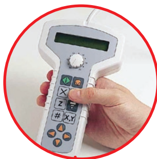
Remote control for various engraving functions