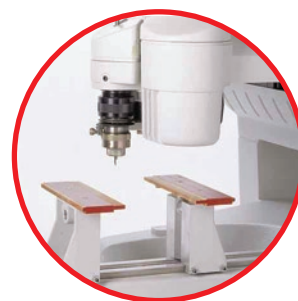
Standard self-clamping vise